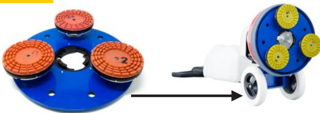
Plate with 3 Satellit