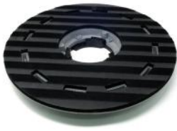
Pad Holder floor pads